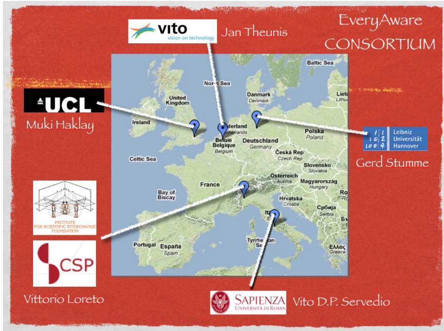
Figure 2: EveryAware Consortium

future and emerging ICT technologies, bringing together social sciences, mathematics and the physical sciences, and information technologies. It combines public research institutions, universities and state agencies, ranging from fundamental sciences to applied science. Additional information is available through http://www.everyaware.eu .